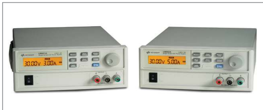
Figure 1. The U8001A 90 W and U8002A 150 W single output DC power supplies